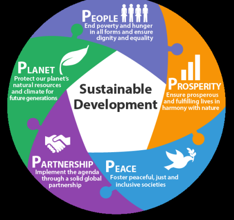
Graphic UN HABITAT

Our work plan aims to deliver and Demonstrate our resolve